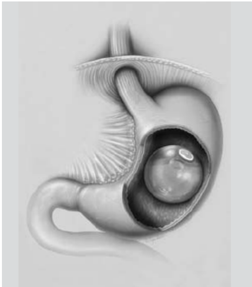
Figure 2. Saline-filled ORBERA™ in the stomach

ORBERA™ is placed in the stomach and filled with saline, causing it to expand into a spherical shape (Figure 2). The filled balloon is designed to occupy space and move freely within the stomach. The expandable design of ORBERA™ permits a fill volume range of 400cc (minimum) to a maximum of 700cc (refer to section 11.2 for filling guidelines). Once filled, the ORBERA™ volume is not adjustable. A self-sealing valve permits detachment from external catheters (see Section 10 Instructions for Use).