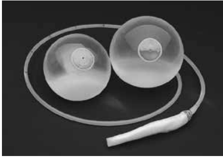
Figure 1. ORBERA™ filled to 400 cc and 700 cc with unfilled system in the foreground

ORBERA™ (Figure 1) is designed to assist weight loss by partially filling the stomach.